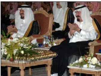
King Abdullah and Crown Prince Sultan

Second Deputy Premier and Interior Minister Prince Naif congratulated Custodian of the Two Holy Mosques King Abdullah and Crown Prince Sultan, deputy premier and minister of defense and aviation, on the occasion of the Saudi National Day on Wednesday.